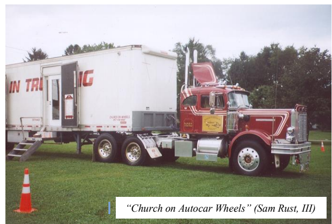
"Church on Autocar Wheels"