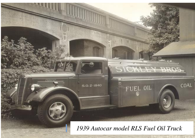
1939 Autocar model RLS Fuel Oil Truck